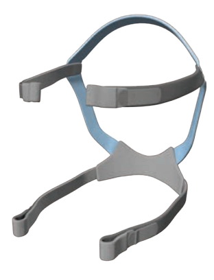
Quattro Air Headgear 62757 Small 62756 Standard