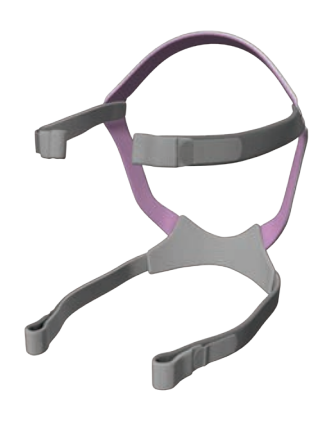
Quattro Air for Her Headgear 62758 Small 62759 Standard