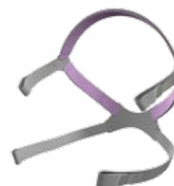
AirFit N10 for Her headgear 63261 (Sml)