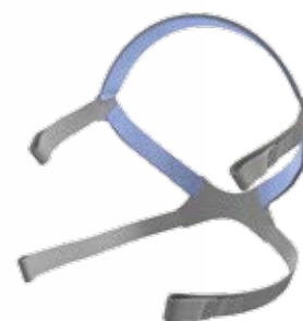
AirFit N10 headgear 63262 (Sml) 63260 (Std)