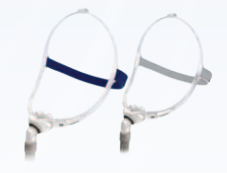
Swift FX Swift FX for Her

With super-soft fit and a minimal appearance, the Swift FX makes it easy to forget about your mask and remember what it's like to get a great night's sleep.