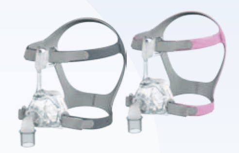
Mirage FX Mirage FX for Her

The perfect balance of lightweight comfort, premium performance and simplicity, the Mirage FX transforms the nasal mask experience. For patients who prefer a wider fit, the Mirage FX Wide is also available.